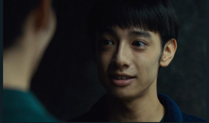
Zihan / TSAO YU-NING

Liu Hsiu-fu is an actor and model. In 2019, he was nominated for the Best New Actor in a Miniseries at the 54th Golden Bell Awards for his role in the TV series On Children – Child Of The Cat . In 2021, he was recognized as the Taipei Film Festival Supernova. His acting credits include TV series The World Between Us , Bonus Trip , and Trick or Love and the films Plurality and Pierce .